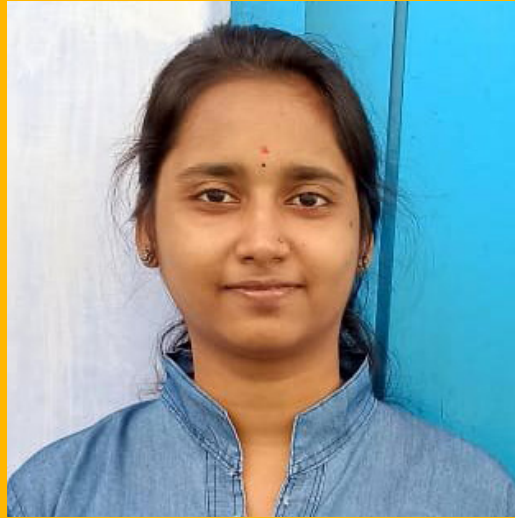
UMA Andhra Pradesh

“I want to see a world where girls and boys are not forced to fit into gender roles.”