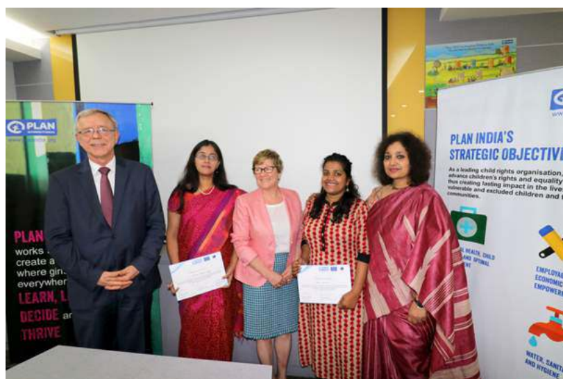
Participants of the Facebook Live session after the event

The campaign reached over 200,000 people overall thus reaffirming Plan India's commitment to enabling girls' and women's rights to a life of their own choosing.