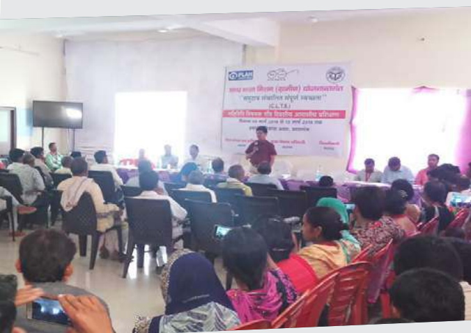
Capacity building session underway in Uttar Pradesh

Plan India is a Key Resource Centre for the Ministry of Drinking Water and Sanitation (MBWS). On behalf of the MBWS, a hands-on training session on Community Led Total Sanitation (CLTS) was organised in March for 82 village level functionaries or 'Swachhagrahis' appointed by the Swachh Bharat Mission – Gramin in Kasganj, Uttar Pradesh.