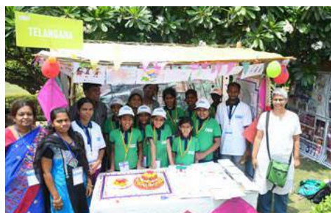
Children and staff from Telangana at their pavilion

The Children's Literary Festival is Plan India's initiative to create an annual platform for children to discover the joy of reading and reimagine gender in textbooks, stories and images. It enables and engages children to play a central role in ensuring that girls and boys are able to learn, lead, decide and thrive through advocacy with educationists, policy makers, teachers, writers, story-tellers and publishers.