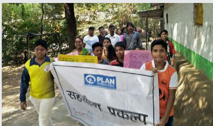
Children participating in a rally to promote better hygiene

As part of the Sahyog project, Plan India, along with its grassroots partners, organised a 'Walkathon' on Feb 12. The four kilometre walk, conducted with community members from Borivali and Goregaon (Mumbai) aimed to spread awareness on cleanliness, handwashing, sanitation and personal hygiene.