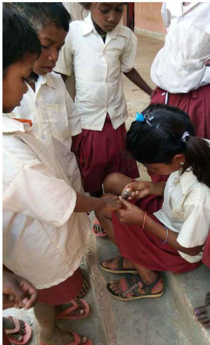
A sanitation monitor conducting a hygiene check

All this has led to the school being nominated for the Swachh Vidyalaya Puraskar, an initiative by the Ministry of Human Resource Development. A remarkable achievement considering the primary leaders of change have been children!