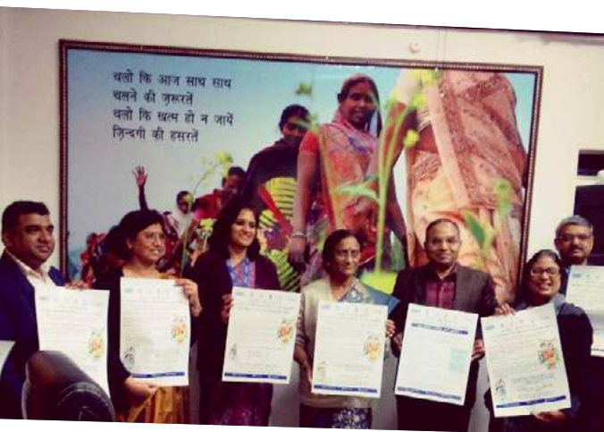
Launching the project with state ministers

Plan India, in partnership with the Department of Women and Child Development (DWCD) and Government of Uttar Pradesh (GoUP) initiated the 'Bal Vivah: Abhi Nahin, Kabhi Nahin' campaign to re-inforce the importance of ending child marriage and to promote child marriage-free Gram Panchayats in the state. A key aspect of the campaign was to promote legal awareness on child marriage as provisioned under the Prohibition of Child Marriage Act (PCMA 2006).